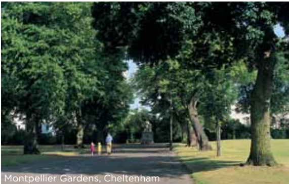
Montpellier Gardens, Cheltenham