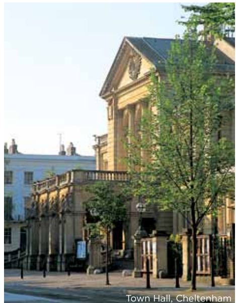
Town Hall, Cheltenham