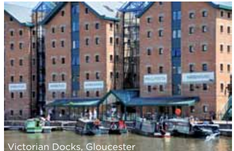
Victorian Docks, Gloucester